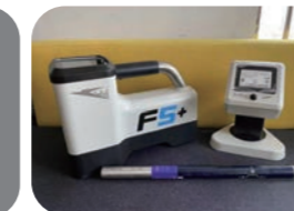
F5 & Transmitter