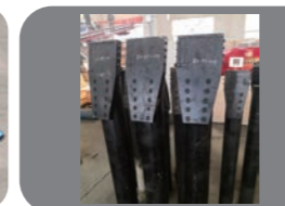
Beacon housing & drill bit