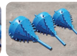
Cone type Backreamer