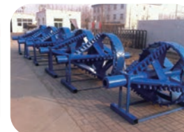
Cutting type Backreamer