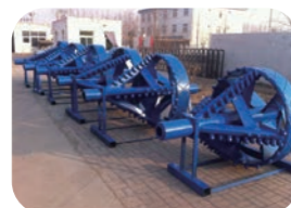
Cutting type Backreamer