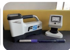
F5 & Transmitter