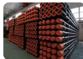
Special make drill pipe