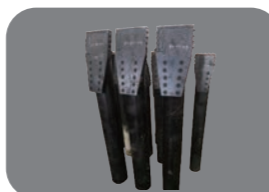
Beacon housing & drill bit