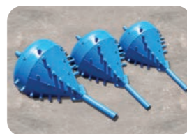
Cone type Backreamer