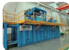
Mud mixing & recycling