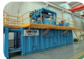
Mud mixing & recycling