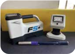
F5 & Transmitter