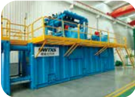
Mud mixing & recycling