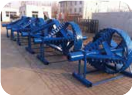
Cutting type Backreamer