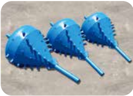
Cone type Backreamer