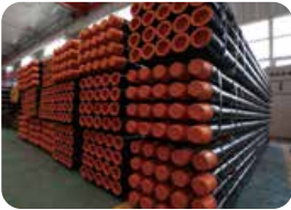
Special make drill pipe