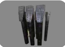
Beacon housing & drill bit