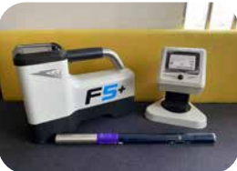
F5 & Transmitter