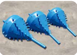
Cone type Backreamer