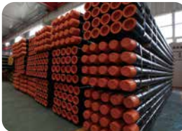
Special make drill pipe