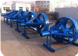
Cutting type Backreamer