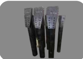
Beacon housing & drill bit