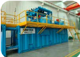
Mud mixing & recycling